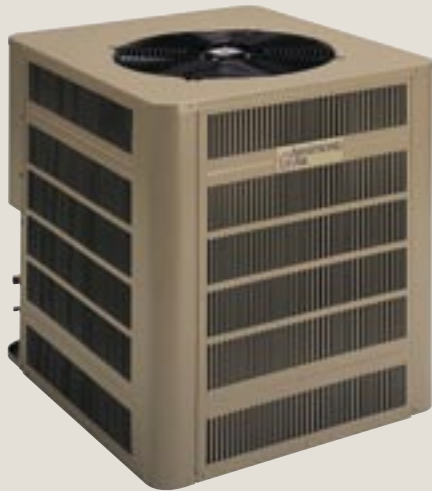
Approximate Five-Year Savings for Enhanced Concept H - 14 SEER

A soft, cushioned chair. A light silk robe. It's that added touch of comfort that can make all the difference. And that's what you get when you choose an Enhanced Concept H air conditioner for your cooling needs. Enhanced with high-performance features like an insulated scroll compressor, Enhanced Concept H air conditioners provide a superior level of quiet, consistent comfort. And efficient operation delivers substantial energy savings, compared to conventional units. For year-round comfort and efficiency in warmer climates, Enhanced Concept H heat pumps are also available.